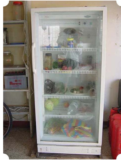
Fig. 6 : Refrigerator of the shop