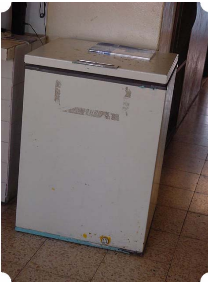
Fig. 7 : Freezer 1 of the shop