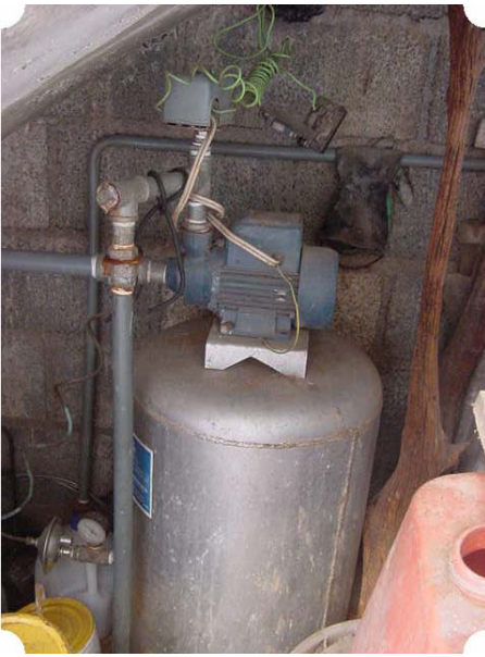
Fig. 9 Water buster pump of the shop