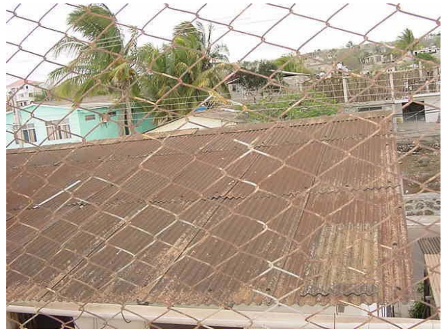
Fig.2 : Asbestos cement roofing of the shop