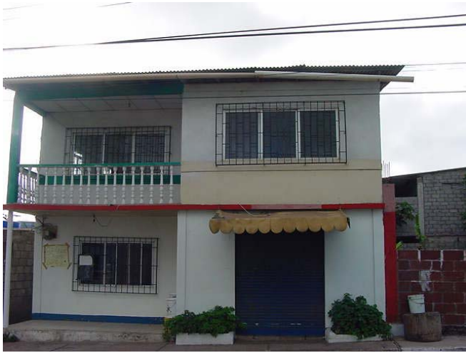
Fig.1 Main facade of Mr. Buenano's shop