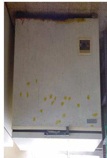
Fig. 8 : Freezer 2 of the shop