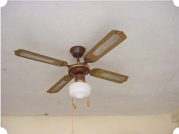
Fig. 5 : Ceiling fan in the shop 75 W