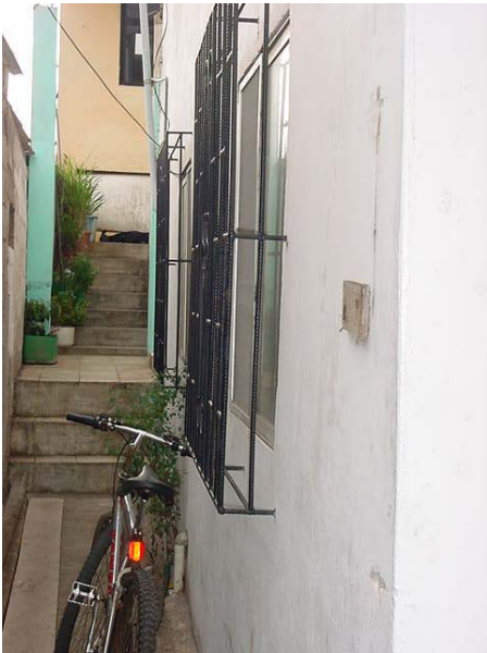
Fig.3 : Single pane windows with iron gratings